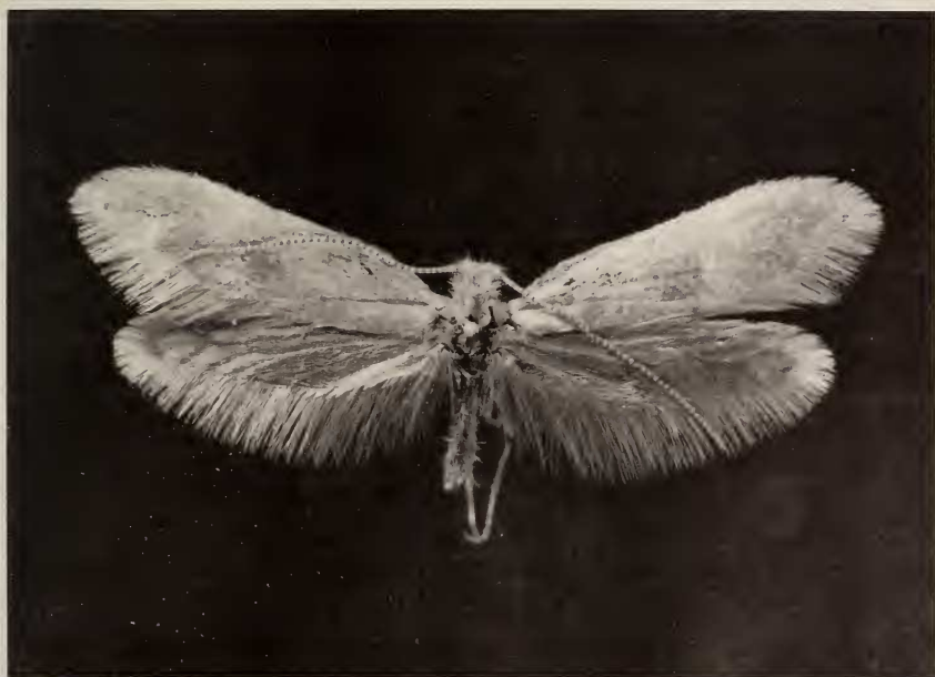
FIG. 1. Acanthopteroctetes aurulenta , new species. Holotype ♂, wing expanse 15 mm.

Head. Vestiture rough, pale yellowish brown to nearly white. Antennae with 43 segments; vestiture of scape extremely rough with prominent pecten of more than dozen